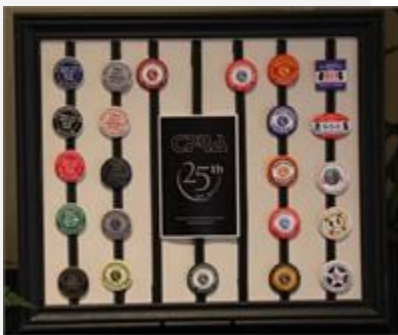
CPRA Button Collection

For the last 30 years, the Southern California Chapter of APCO (CPRA) has been commemorating the "National Public Safety Telecommunicators Week" by creating buttons and offering them to chapters across the country.